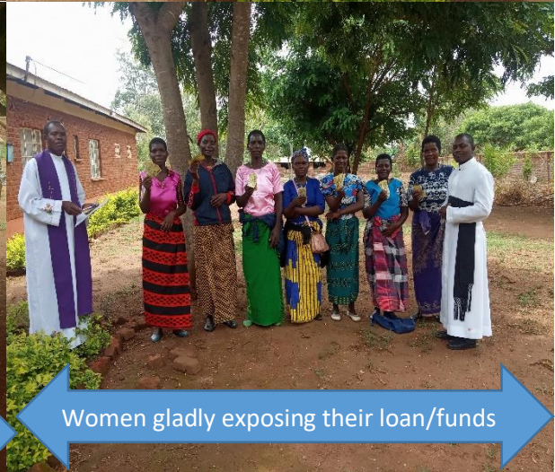
Women gladly exposing their loan/funds