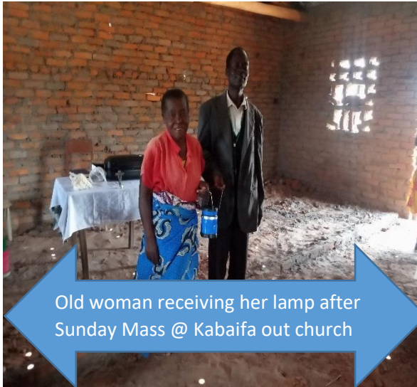
Old woman receiving her lamp after Sunday Mass @ Kabaifa out church