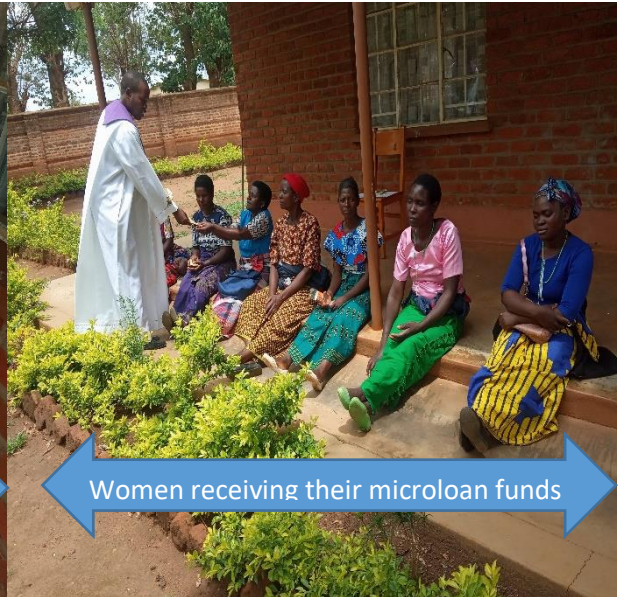
Women receiving their microloan funds