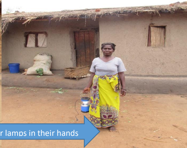
Poor women with solar lamps in their hands