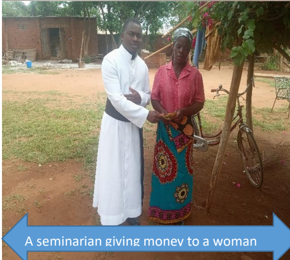
A seminarian giving money to a woman