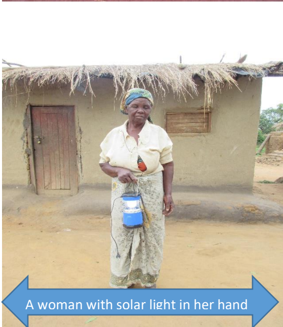
A woman with solar light in her hand