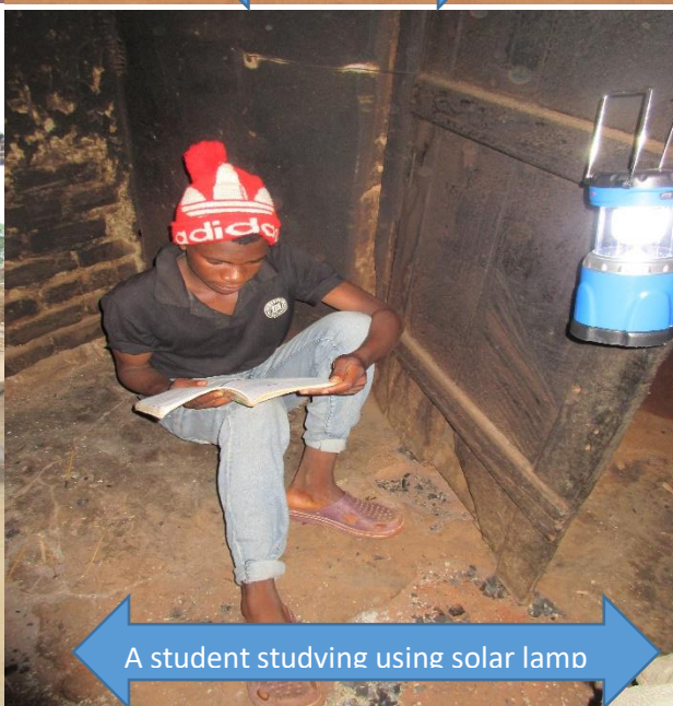
A student studving using solar lam