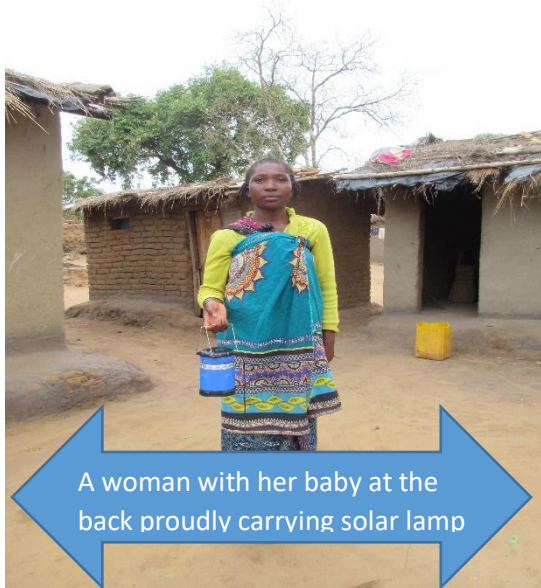
A woman with her baby at the back proudly carrying solar lamp