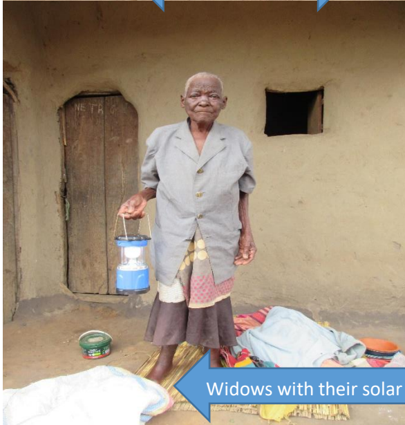
Widows with their solar lamps in hand