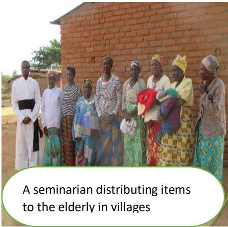
A seminarian distributing items to the elderly in villages