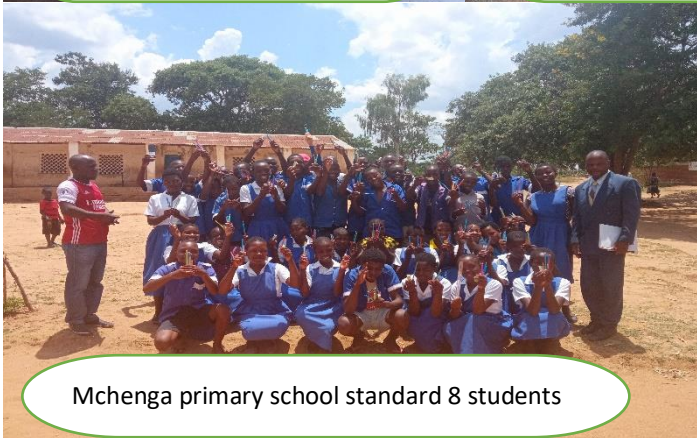
Mchenga primary school standard 8 students