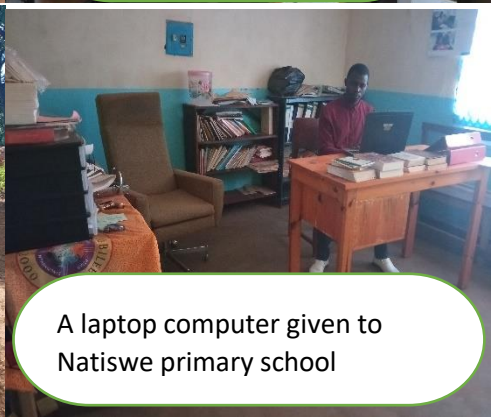
A laptop computer given to Natiswe primary school