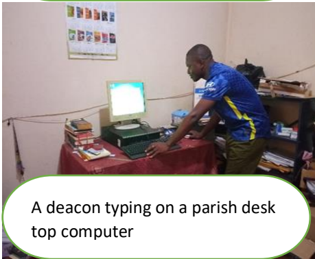
A deacon typing on a parish desktop computer