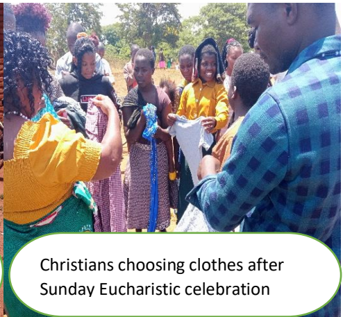
Christians choosing clothes after Sunday Eucharistic celebration