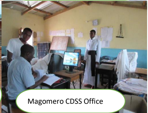
Magomero CDSS Office