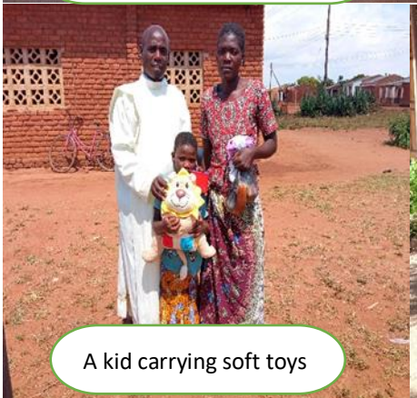
A kid carrying soft toys