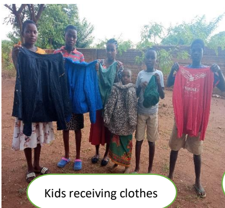
Kids receiving clothes