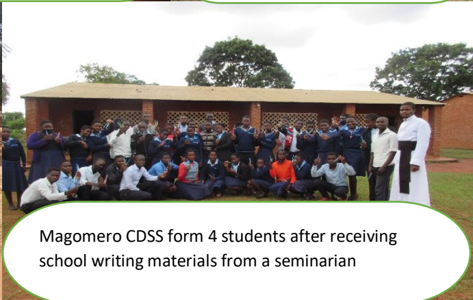
Magomero CDSS form 4 students after receiving school writing materials from a seminarian

We appreciate for the various container items you send us yearly and they are of great help to the parishioners. We, finally, ask God to continue blessing you in your everyday endeavours.