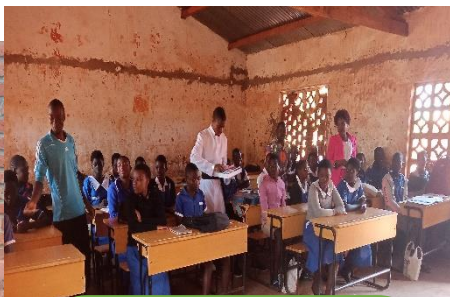
Magomero primary school standard 8 students receiving school writing materials