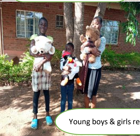
Young boys & girls receiving soft toys