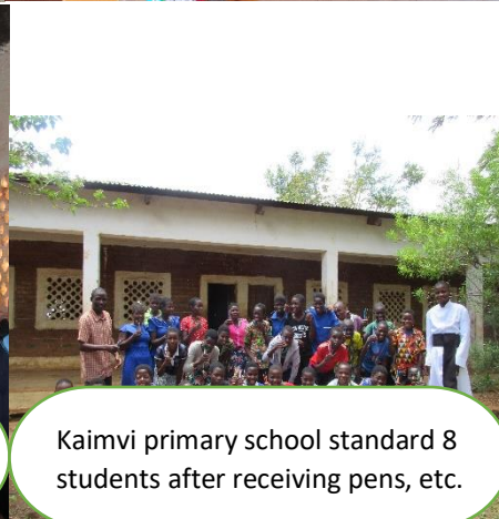
Kaimvi primary school standard 8 students after receiving pens, etc.