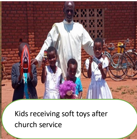
Kids receiving soft toys after church service