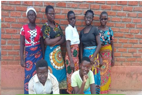
Posing while putting on reading glasses / spectacles