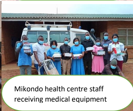
Mikondo health centre staff receiving medical equipment