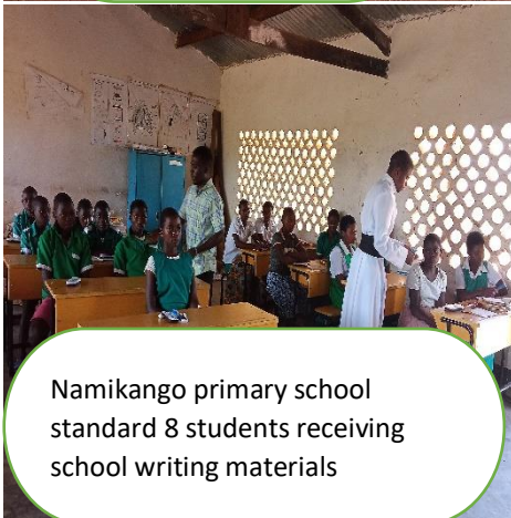
Namikango primary school standard 8 students receiving school writing materials