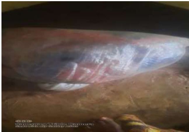
Figure 4. Maize seeds