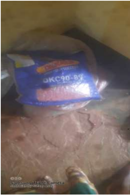
Figure 5. Maize seeds