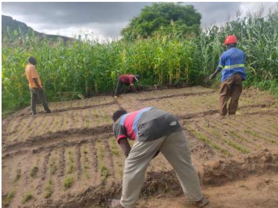
Figure 11. removing weeds