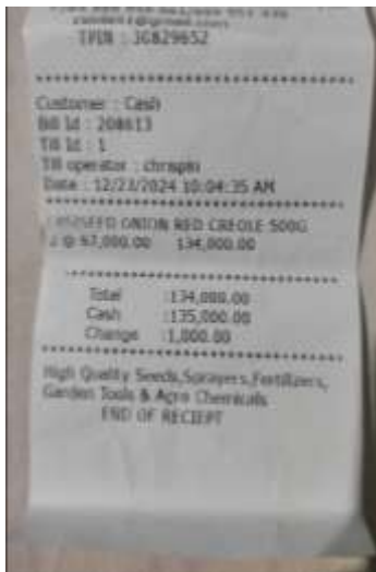
Figure 2. onion payment receipt

Early December I received the funds for my farming project with great joy and I committed myself to utilise the funds for the best results. The funds came in the time that I was also organising myself to utilise the rainy season for maize production. I understand that the whole funding was committed to onion production. However, I had to take both projects for demand of maize is also high especially from September to March. For each year, the country faces hunger problem so maize becomes so expensive.