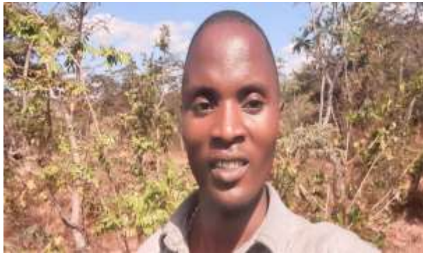
Figure 8. Gold search in Nathenje

The gold mining activities have been illegal ever since in the country. There have been no clear laws governing the mining activities and politicians lead most of these mining activities. So the order is lacking in the governance of gold mining and other precious stones.