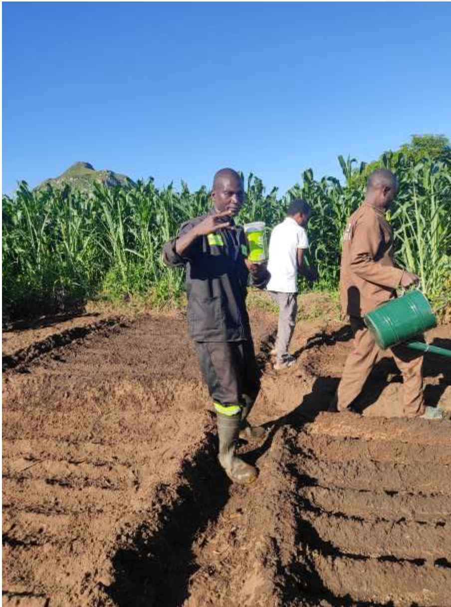
Figure 12. with my team fro the company