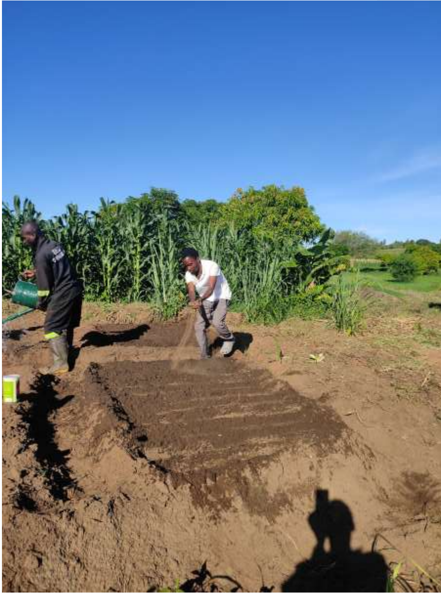
Figure 13. Parable of the sower

Lastly, I want to say that the first report and pictorial updates have taken time to be reach you for I wanted to have crops in good shape. You will receive regular updates on both projects as the crops are now growing. I also want to say that I will have the pump in in two weeks' time. I will share with you the pictures and everything necessary.