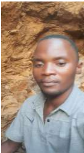
Figure 7. inside gold mining pit