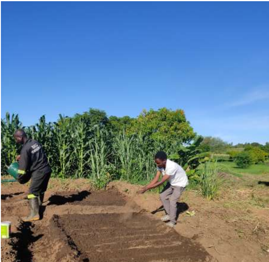
Figure 10. 11th january sowing day

I sow the seeds for one tin on 11 th January and I will be transplanting towards the end of February. I will grow one tin right here in Chiradzuro. The company has a bigger space with plenty water. The area is close to Blantyre so I am sure I will have a good access to the Market. I will give regular updates on the crops as they are advancing in the stages. Here are the primary photos on onion production.