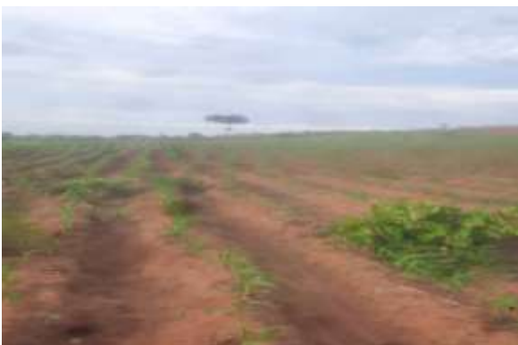
Figure 9. Maize farm

The crops have offered good germination and they are three weeks old. All the five acres I have grown Sasakawa; that is one plant per station. I applied fertiliser for growth before the weeding for the ridges were just fresh and there was not much grass. The weeding process started on Monday 27 TH January and they have completed yesterday on 31 st January. I sent Mercy to take some pictures and videos, which I have shared with you below and in excel. The pictures are not so clear for the phone's camera is not clear.